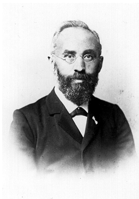
Figure 2. Hendrik Antoon Lorentz.

This kind of inspiration fits in with what we can learn from material in the Zeeman archive. In a notebook, started in 1890 as a record of his intellectual development, Zeeman jotted down all kinds of thoughts