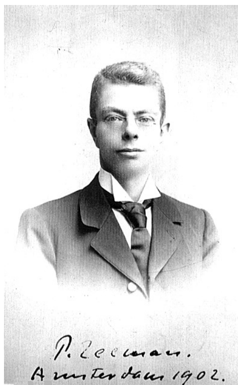
Figure 1. Pieter Zeeman.

work no notes are preserved. But there is an intriguing letter to Onnes from 1891, in which Zeeman reports having looked at the spectrum of iron in a magnetic field and having been ‘unable to observe a displacement of the lines’ [5]. It is possible that this is a reference to the earlier experiment.